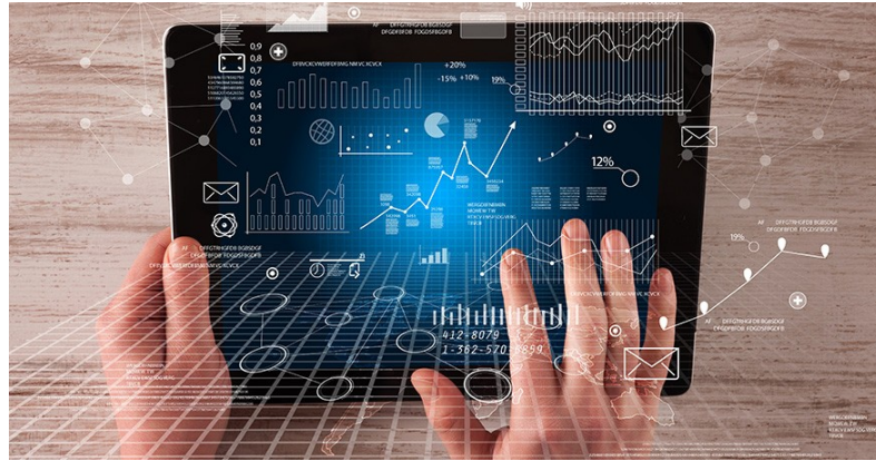
Industrial Smart/Remote Working