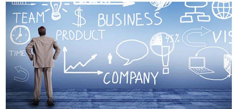
Modelli di Business