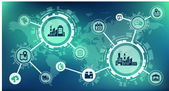
Operations & Supply Chain